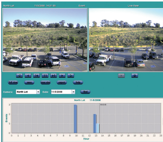
User-friendly Playback Page